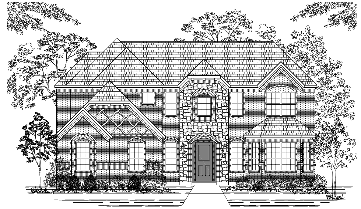
ELEVATION A WITH BEDROOM 4 OPTION